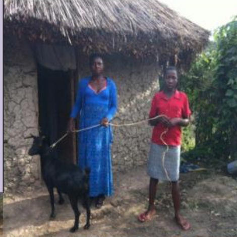
Some of the Families with their new goat/cow

It is our aim this year to give out at least 50 English bibles and 50 local language bibles. So far we have given out 30 local language bibles and 15 English bibles. Please pray that God would continue to help us fulfil this goal.